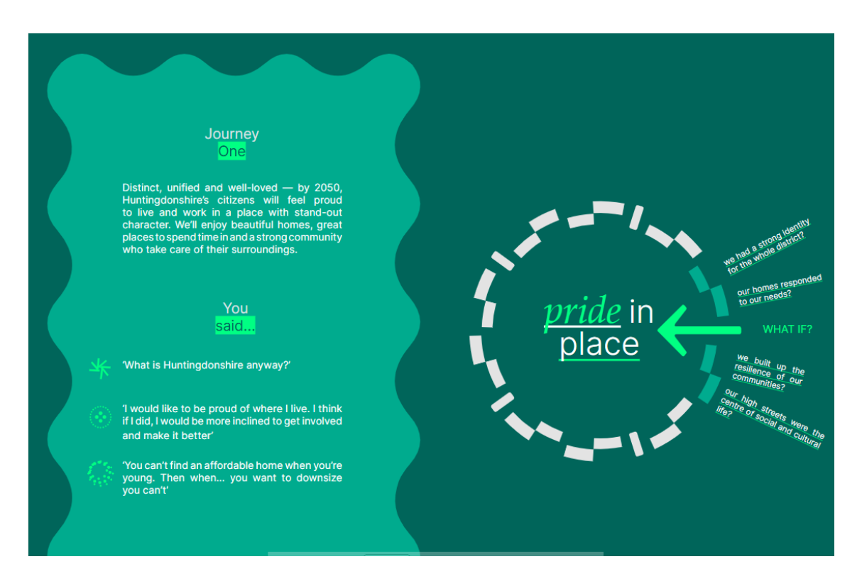
Diagram 3: Journey and Pathway example